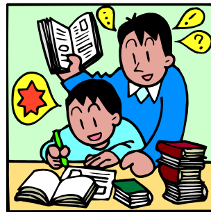
W.O.L Kid's News For Kids...and Kids at Heart