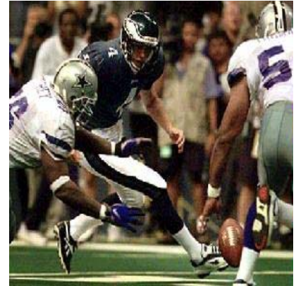
The Eagles are about to recover a fumble

Inside West Oak Lane:. In West Oak Lane we play football, basketball, base- ball and soccer. The boys and girls can play on the same team, but there are also separate teams.