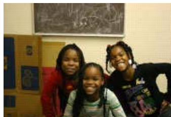
Computer Club Students

There is a church called pal it is the best places to be if you a boy pal with a basketball and if