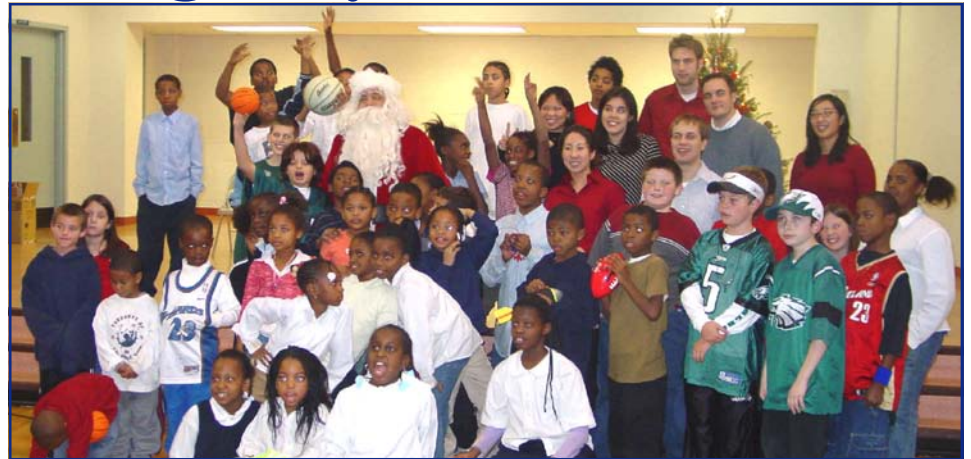
PAL kids and Lincoln Financial Group employees celebrate the season at Cozen PAL.

On Oct. 23, the Police Athletic League of Philadelphia and Aetna, Inc. held a citywide Children's Health Fair at the 23rd PAL Center, located at 1845 N. 23rd St. from 6:00 – 8:00 p.m. PAL, which has expanded its programs to include important educational and cultural initiatives in recent years, hopes the Health Fair will increase awareness of health-related issues affecting Philadelphia's inner-city communities.