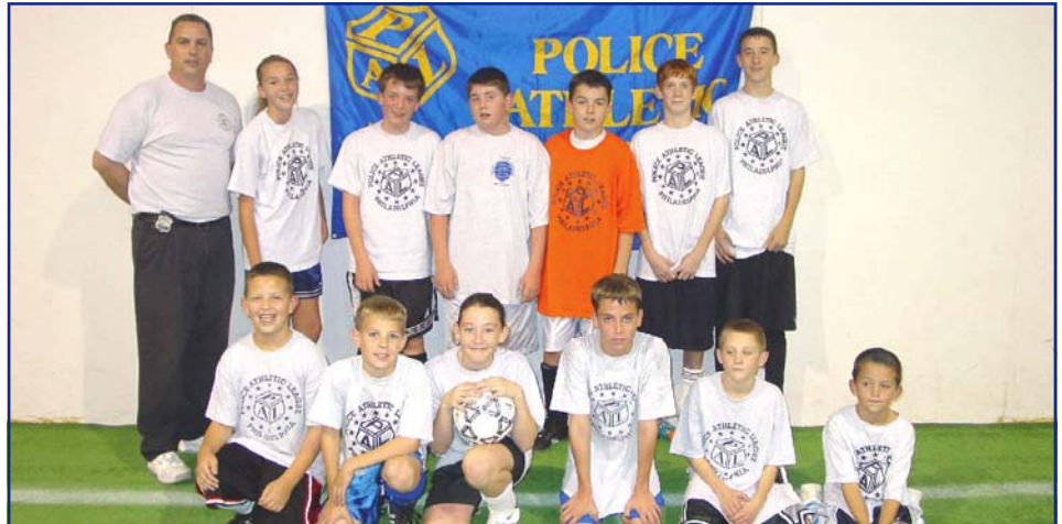
In November, Rizzo PAL (pictured) rolled over the competition en route to their second indoor soccer title in the last three years. In the championship game played on Nov. 18, Rizzo PAL defeated Tacony PAL. Sixteen teams competed in PAL's 14 & under coed citywide indoor soccer league this year.