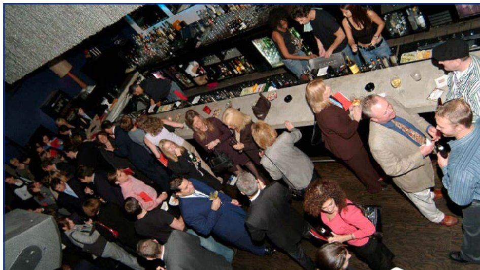
PAL supporters mingle at the first-annual “Make a Celebrity PAL” event on Nov. 5. Denim Lounge (1712 Walnut St.) hosted the star-studded evening.