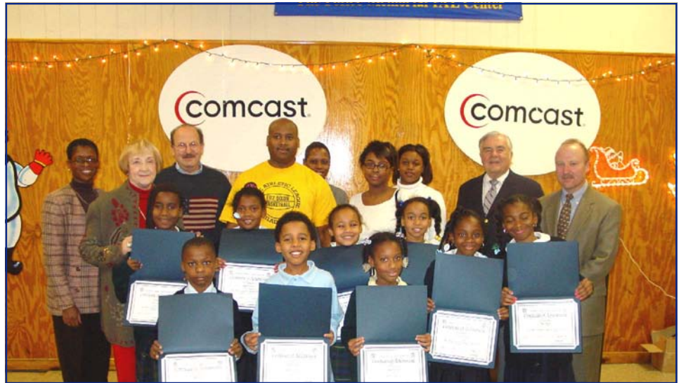
Members of the West Oak Lane PAL/Comcast Community Connections Computer Education Program receive their diplomas.

Last year, PAL's technology program took another giant step forward as The Comcast Foundation made a two-year commitment of $100,000 to implement the Comcast Community Connection Computer Education Program. This program provides a structured technology-learning curriculum teaching a wide range of computer skills including