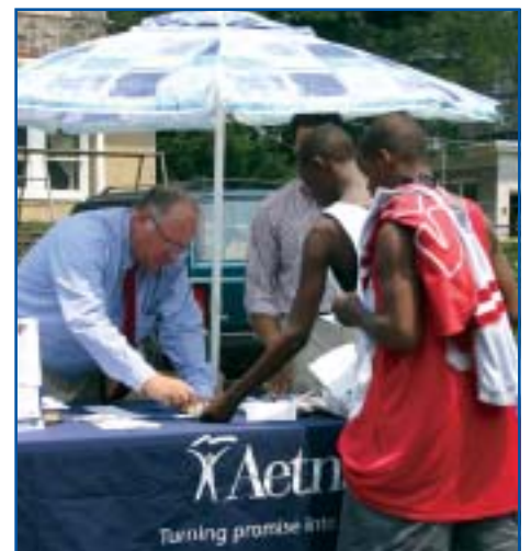
Aetna, Inc. representatives speak with PAL youngsters.

More events are planned in 2005, as Aetna has expanded its grant to $25,000 for the coming year.