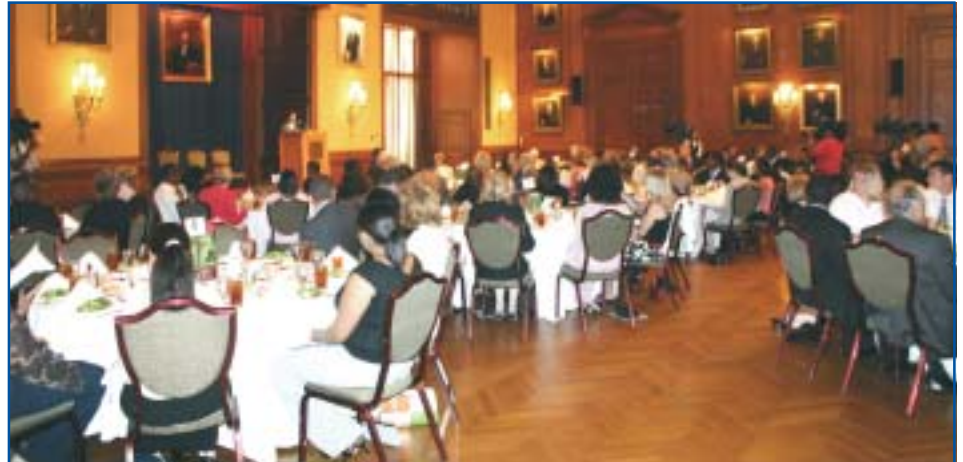
PAL held its annual Scholarship Luncheon at the Union League on June 22.