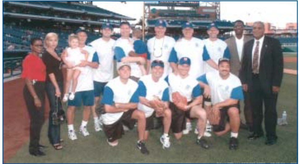
PAL Officials, sponsors and members of the winning Television/ Newspaper Media All-Stars pause for a pre-game team photo at 2004 PAL Night at the Phillies.