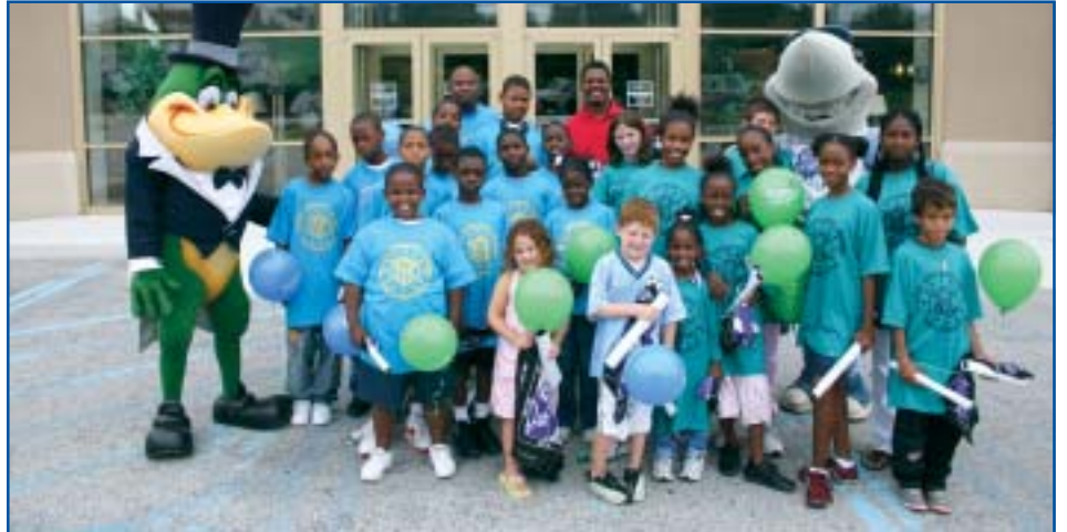
Throughout July, Raymour and Flanigan Furniture teamed up with Philadelphia's WB17 and the Camden Riversharks to hold a book drive benefitting PAL. PAL kids were also invited to attend special book readings at Raymour and Flanigan stores.