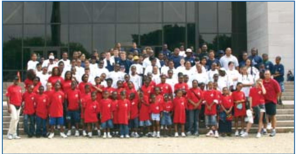
PAL officers, staff and youngsters gather outside the National Air and Space Museum in Washington, D.C.

The summer season kicked off on June 24, when over 200 PAL young people spent the day at The Franklin Institute Science Museum . Sponsored by The Franklin Institute and Comcast SportsNet , the children enjoyed a day full of exciting science experiments and discoveries. The day began with a show at the Fels Planetarium where the children explored the outer reaches of the Milky Way in “Wonders of the Universe”. Between presentations the students were free to explore exhibits including Space Command, The Train Factory,