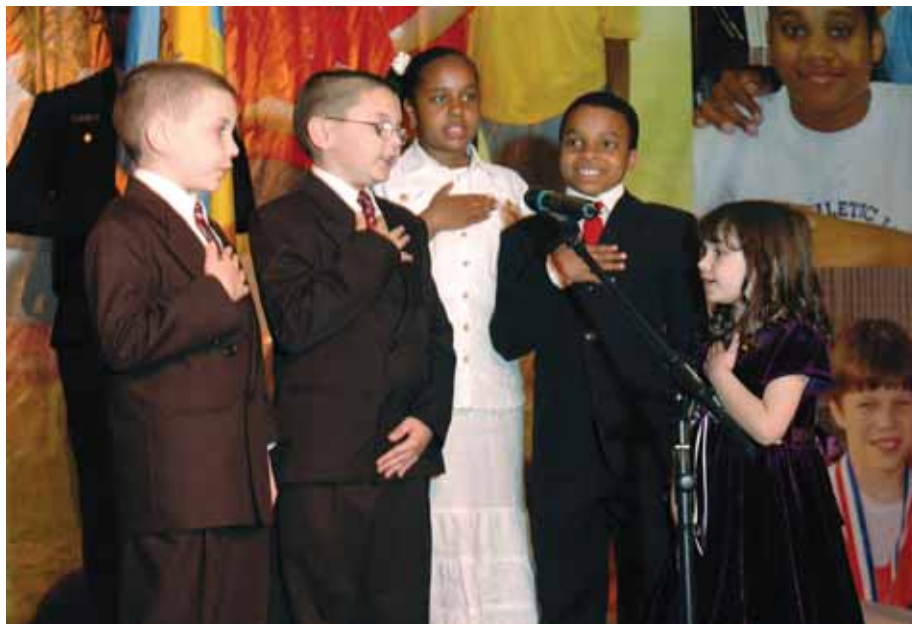
A group of PAL children recite the pledge of allegiance, leading the attendees at the PAL Award Dinner.