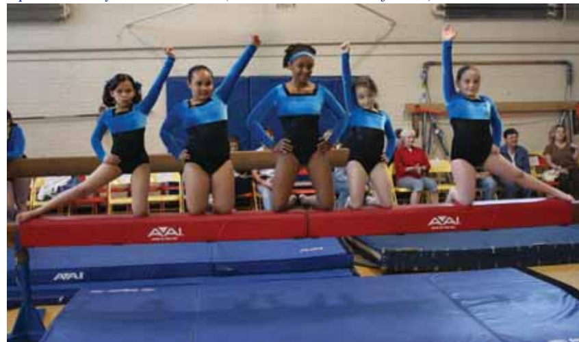
The UPS gymnastics program marked another year of flips, vaults and hand-stands as they put on a large scale performance in May to show their parents all the new skills they have learned. UPS funds the program and allows PAL to provide new uniforms and equipment.