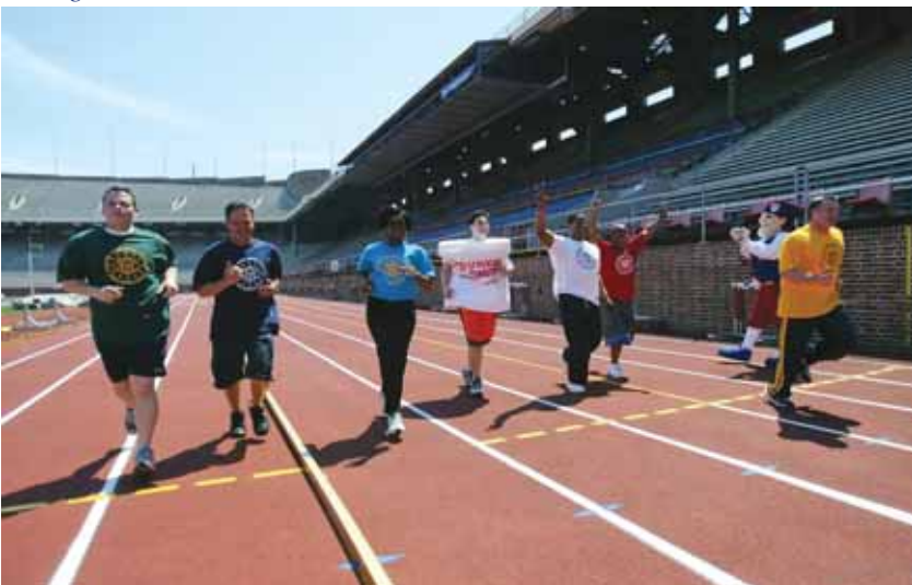
Dunkin' Donuts started a new Penn Relays tradition on April 23rd with the "Cup vs. Cop" race. The race marked the start of the Penn Relays and Dunkin' Donuts made a $3,000 donation to PAL.