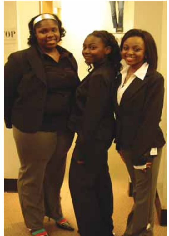
Three young ladies model new business suits, that were given to them courtesy of Charming Shoppes, Inc. to wear as they shadow Philadelphia City Officials as part of PAL Day at City Hall.

The suit not only helps them look professional for their day at City Hall, but can be used time and time again as they embark on future job interviews and business meetings.