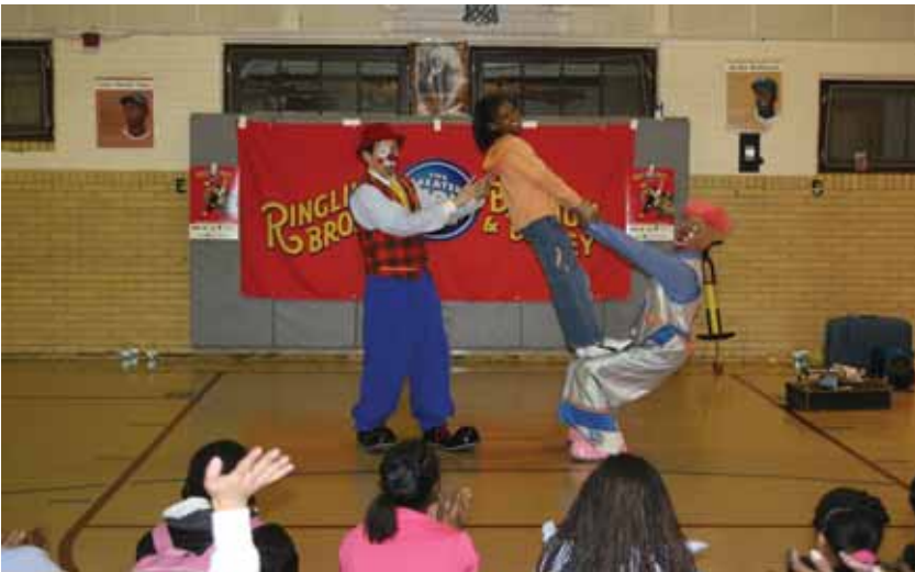
The Circus came to Point Breeze PAL on April 11th as clowns from the CircusFit program taught the youngsters the importance of staying fit through several acrobatic demonstrations.