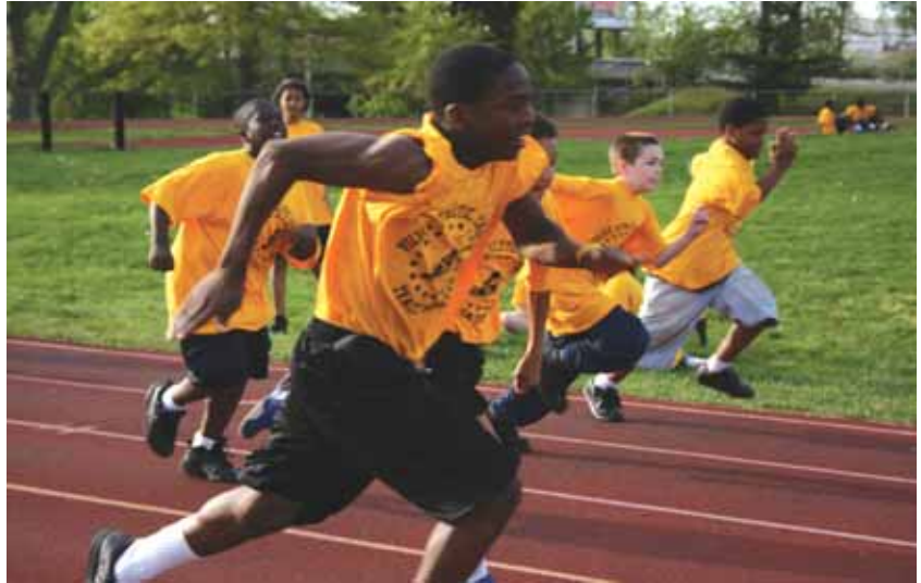
Several sprinters compete in a 100-meter race at PAL's track competition on May 3rd at Edison High School.