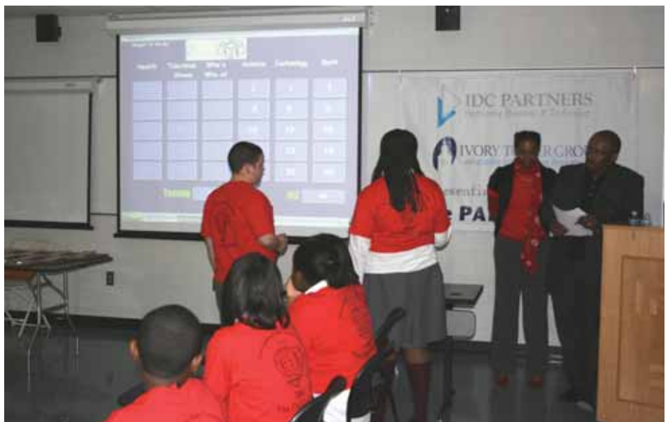
The IDC/Ivory Tower PAL Challenge is a fusion of "Jeopardy" and "Family Feud". The championship match was held at Temple University on April 18th and crowned Wissinoming PAL the champion.

cluded 162 youngsters from 6 th – 8 th grade.