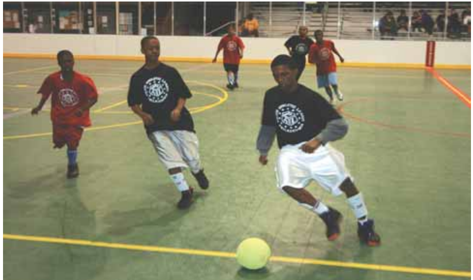
Verizon Wireless Citywide Soccer Championships were held on April 10th and 12th. The program brings soccer to youngsters who normally would not have access to the sport.

unique option not readily available for inner city youth. This program for many of our youngsters is the only way they will ever have the opportunity to enjoy the game in their childhood. We are thrilled that so many kids are able to take advantage of this league."