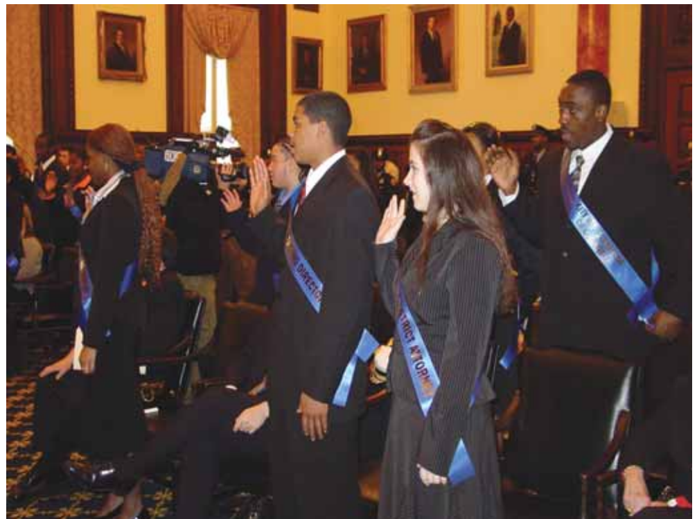
On February 26th, 27 PAL teens were “sworn in” during a mock ceremony as part of PAL Day at City Hall. Later, the teens shadowed various City Officials to see how the city of Philadelphia is run on a daily basis.